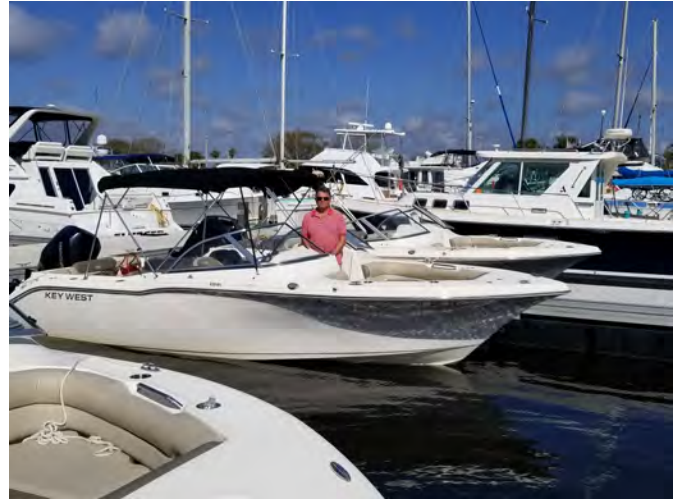
Here's our Freedom Boat Club boat for the day, a Key West bowrider.