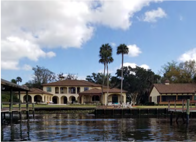
This stretch of the ICW has many lovely houses

I really don't need much of an excuse to seek sunny skies and warm breezes in February, so it was pretty easy reach to sign us up to attend the National Conference in Florida. The weather was amazing, sunny and warm and perfect for a ride on the ICW at Jacksonville Beach a few days before the conference started.