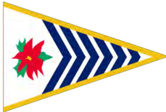
4" Burgee Decal 1.00