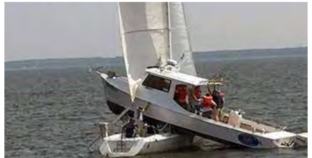
A knowledge of the Rules of the Road is critical for safe boating.

The modules can be subscribed to and studied individually or as a complete course. The complete course includes an optional online test, which covers material contained in both the Student Guide and the six online modules. Members who take this online course and pass the online exam will get credit for Boat Handling the same as if they had taken the course in a classroom setting .