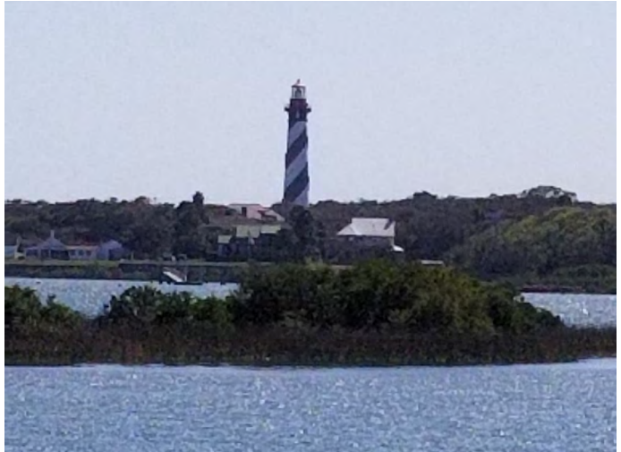
St. Augustine Lighthouse was built in 1871 and is 165 feet tall with 219 steps.