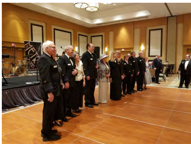
The new Bridge members were announced one by one as they entered the ballroom with their partners