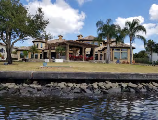
One of my favorites