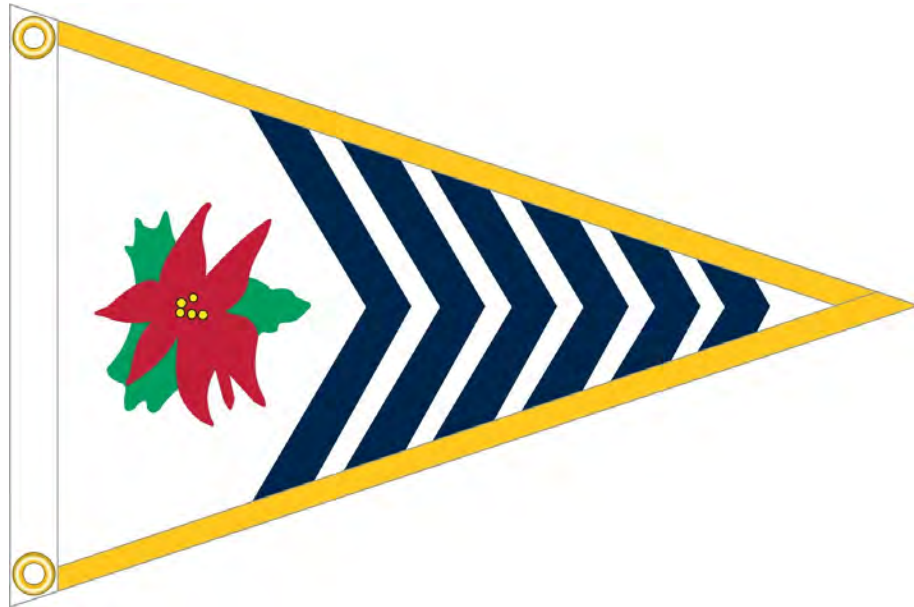
12" by 18" Burgee Price 26.00