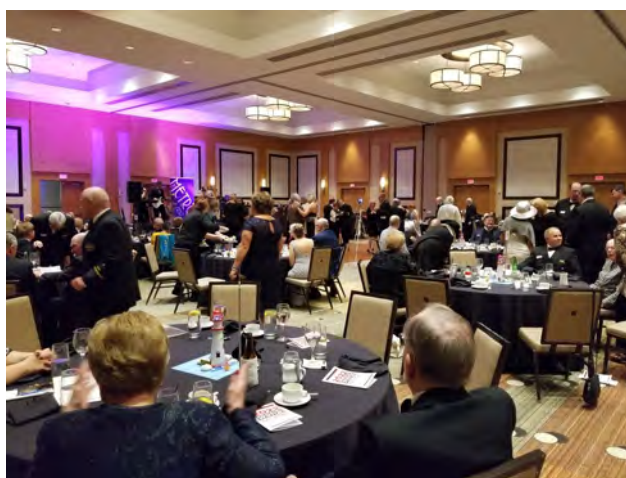
There was a nice turnout for the Saturday night Change of Watch Dinner and Dance

On a more serious note, one of the seminars I attended was learning about the Information Center which is replacing DB2000. It seems quite robust and loaded with good information. In the coming months, I plan to share five or so topics that I think will be helpful to our Bridge.