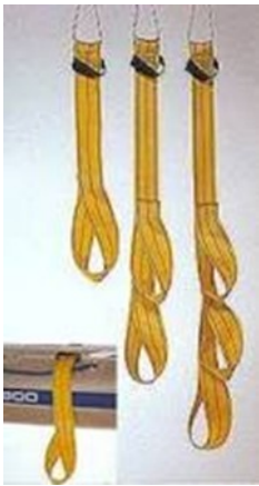
Third Place: C-level Sea Steps Safety Ladder