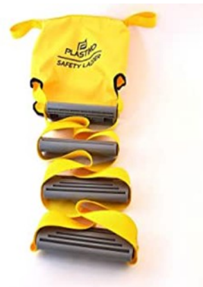
Honorable Mention: Plastimo Five Step Safety Ladder