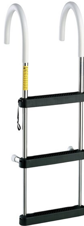
Second Place: Garelick/Eez-In Telescoping Hook Ladder