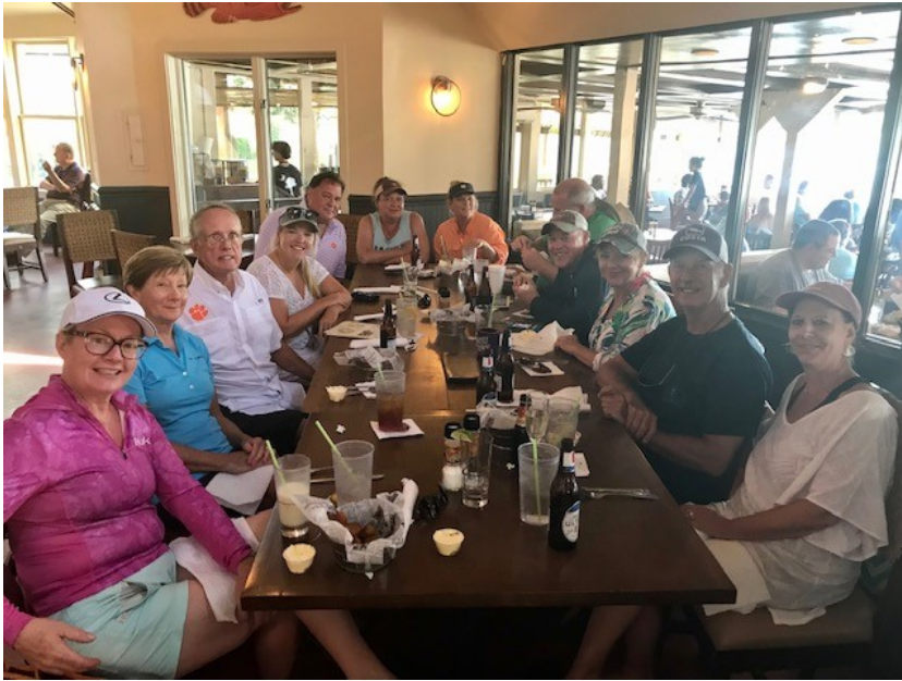
The Motley Crew