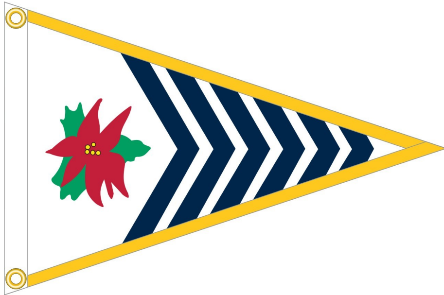
12" by 18" Burgee Price 26.00