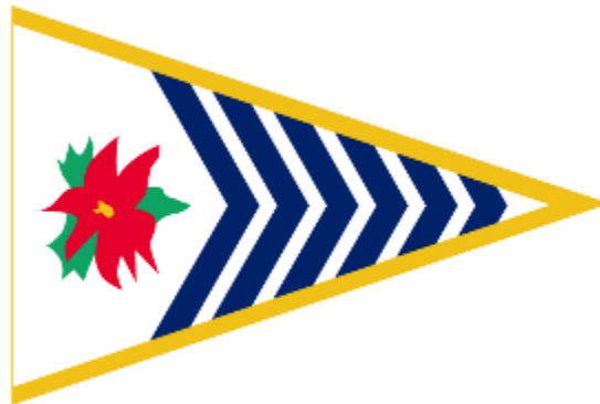
4" Burgee Decal 1.00