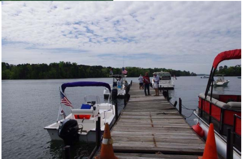
A good start to boat inspections