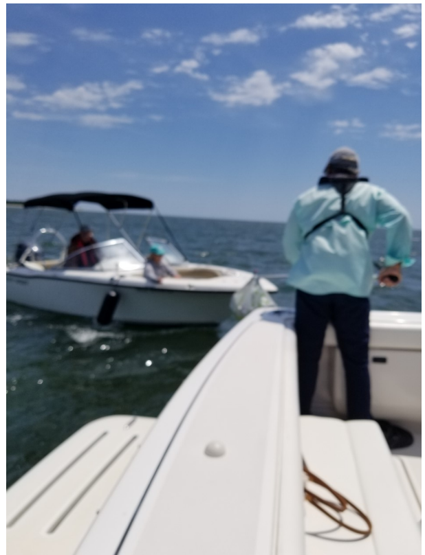
Delivering lunch to another member