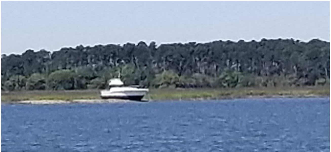
Happy to say “not one of us”, seen while on the way to Daufuskie Island. Bad day for them though.