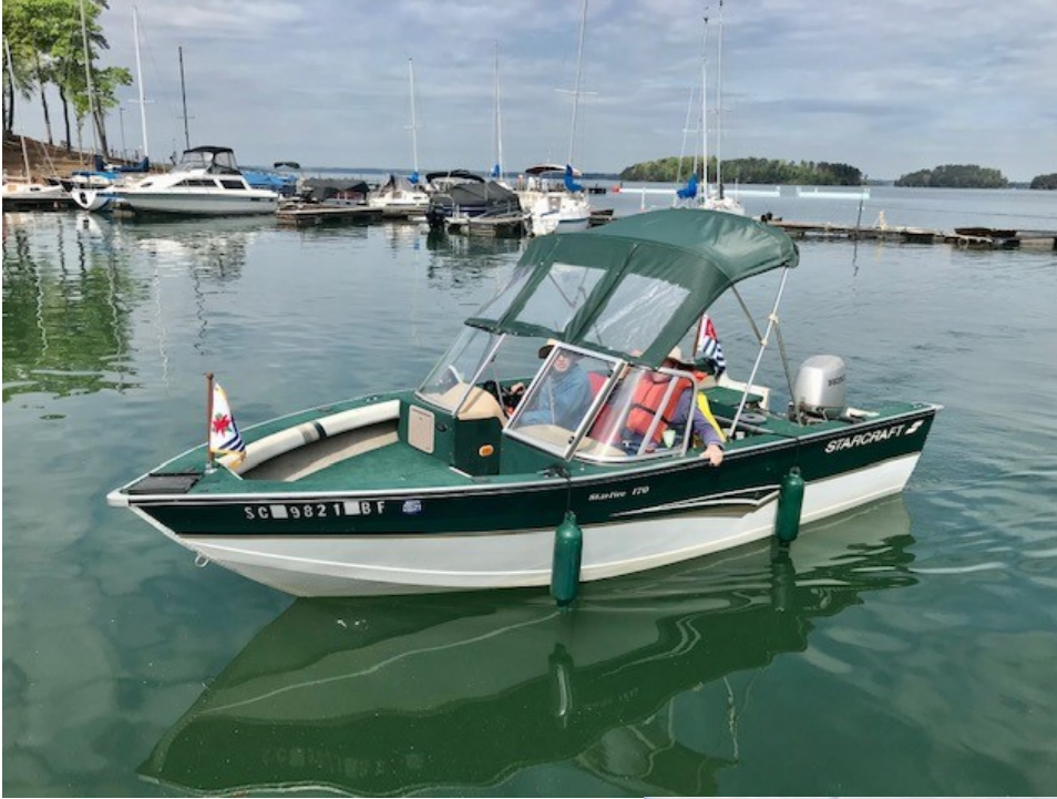
Don and Janice Woodard's boat SNARK

A very successful Shakedown Cruise is in the books! The weather actually ended up cooperating Saturday, much to our surprise. There was a steady stream of members and others showing up to get their boats inspected. We ended up with about 17 boats and around 37 members/guests and completed a total of 15 VSC's.