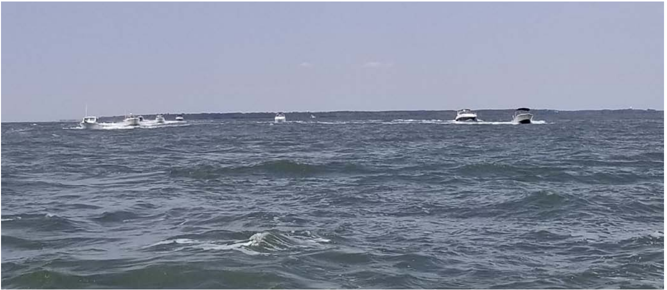
History Tour Flotilla