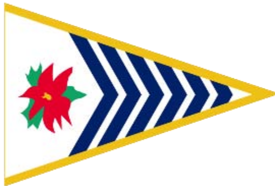
4" Burgee Decal 1.00