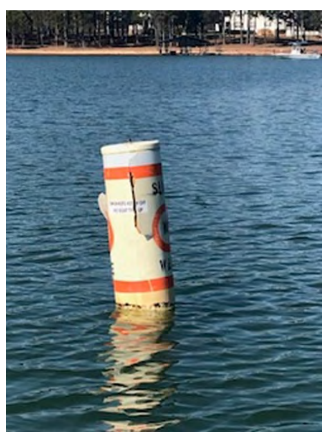
A new law increases the distance limit for operating in excess of idle speed to 100 feet on most state waters and prohibits wake surfing within 200 feet on all S.C. waters.

There are widespread complaints about lack of enforcement of the previous limits, and law enforcement officers are stretched thinner than ever. The longer the distance of the zone, the more difficult it is to gauge the distance from an anchored boat or dock. It would seem gaining a conviction would be very difficult for prosecutors of those arrested for infractions of this law. For these reasons, many have concerns about the wisdom of passing what could be unenforceable laws.