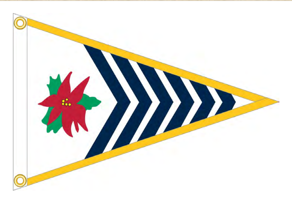
12" by 18" Burgee Price 26.00