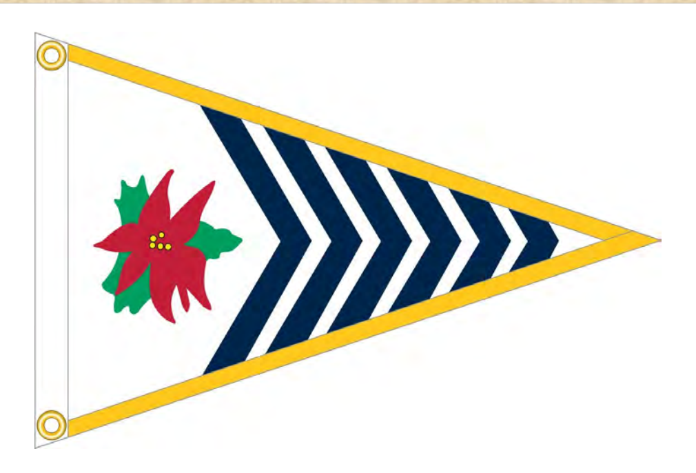
12" by 18" Burgee Price 26.00