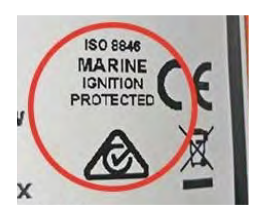
Make sure all components used below deck carry the Marine Ignition Protected label.