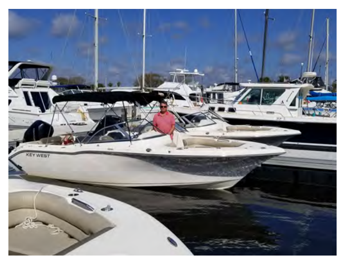
Here's our Freedom Boat Club boat for the day, a Key West bowrider.