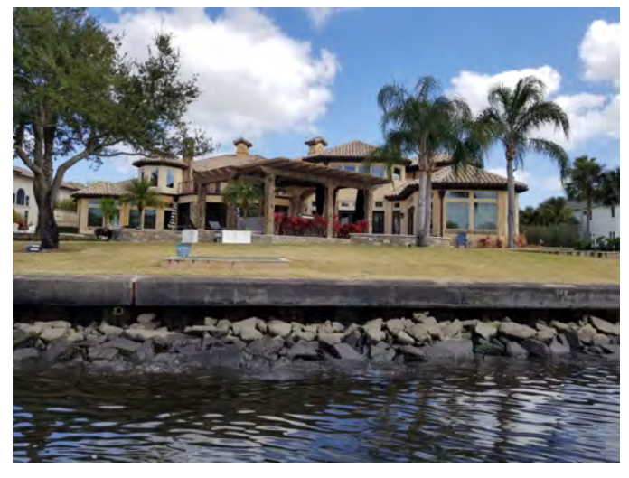
One of my favorites