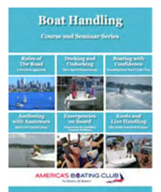
Students receive a comprehensive, 250-page, Student Guide

• Knots and Line Handling: Knots You Need to Know. Securing boats to docks, piers, and other boats; handling rescue and repair situations; managing running rigging; anchoring securely; towing other vessels or people; tying the 10 most useful knots, bends, and hitches.