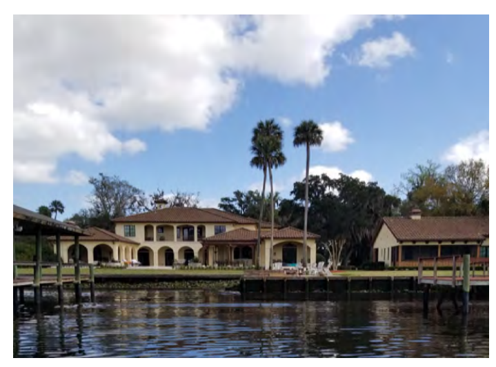
This stretch of the ICW has many lovely houses

I really don't need much of an excuse to seek sunny skies and warm breezes in February, so it was pretty easy reach to sign us up to attend the National Conference in Florida. The weather was amazing, sunny and warm and perfect for a ride on the ICW at Jacksonville Beach a few days before the conference started.