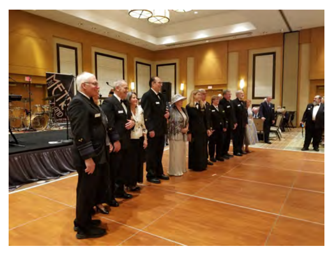
The new Bridge members were announced one by one as they entered the ballroom with their partners