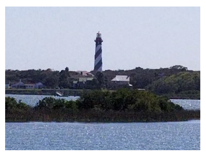
St. Augustine Lighthouse was built in 1871 and is 165 feet tall with 219 steps.