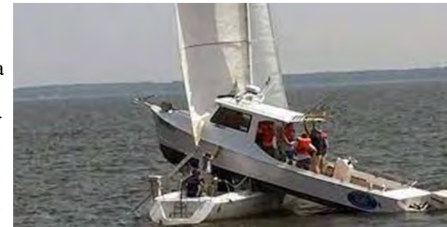
A knowledge of the Rules of the Road is critical for safe boating.

The modules can be subscribed to and studied individually or as a complete course. The complete course includes an optional online test, which covers material contained in both the Student Guide and the six online modules. Members who