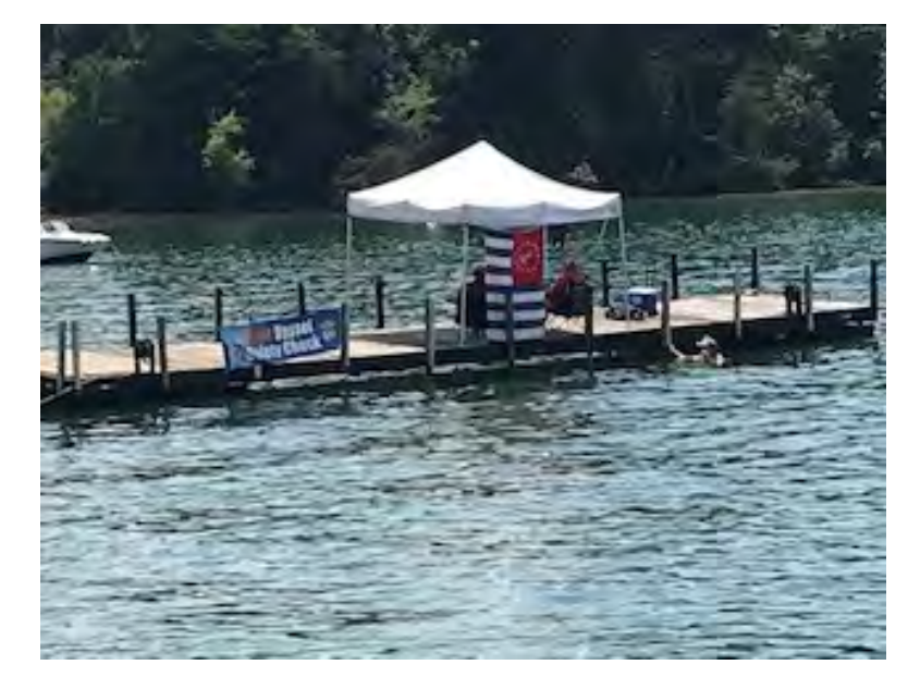
Floating Dock used for Vessel Safety Checks at Big Water Marina

Check out Fireforge online <u>https://www.fireforge.beer/</u> if you want to know more.