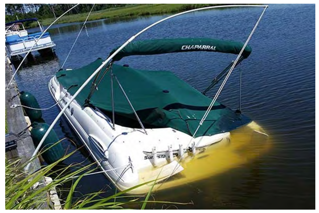
The cover on this boat filled with rainwater, and because the scuppers were already at the waterline, they back-flooded, and the boat sank.