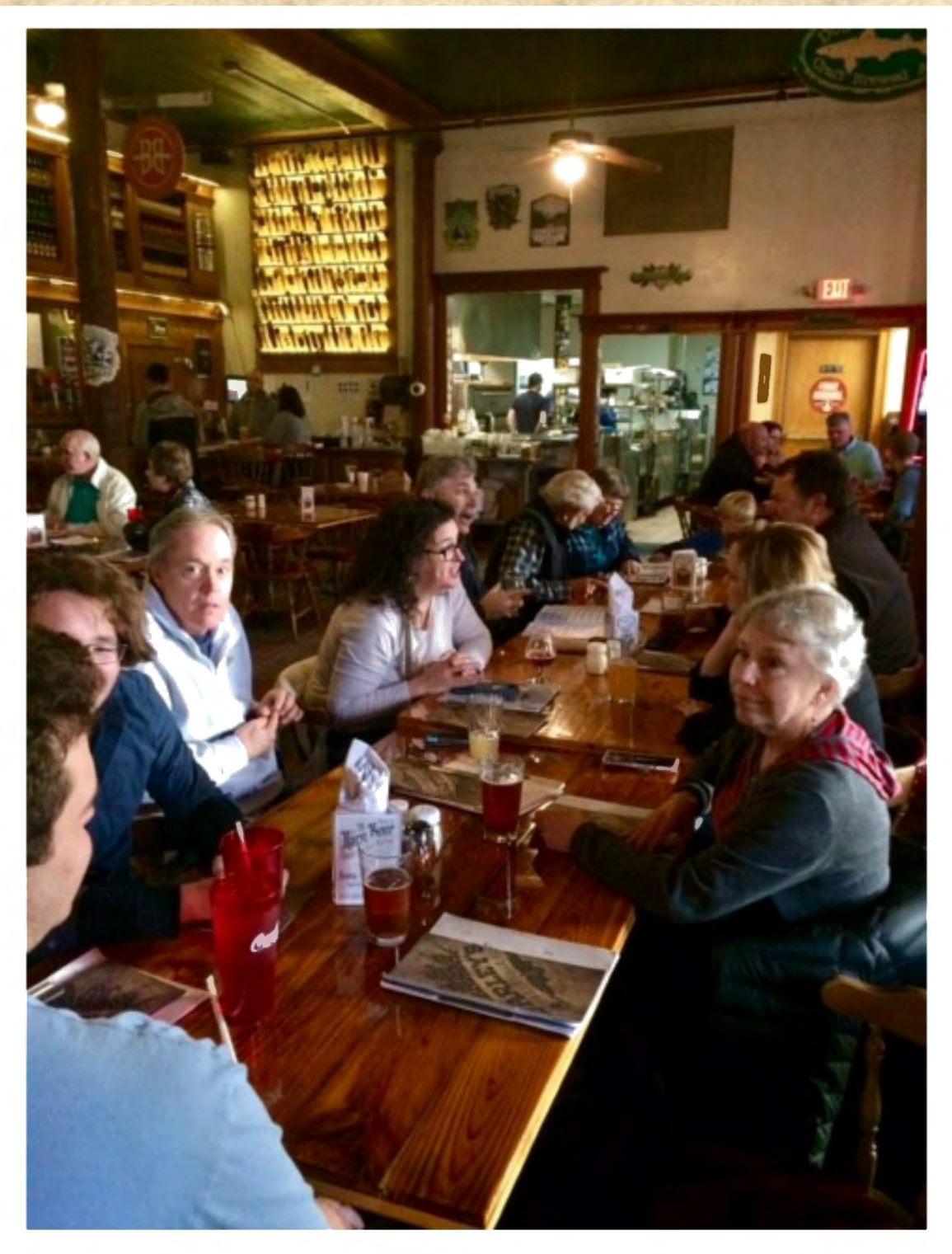
Our Happy Hours are gaining in popularity. 14 folks attended this month at Barley's.