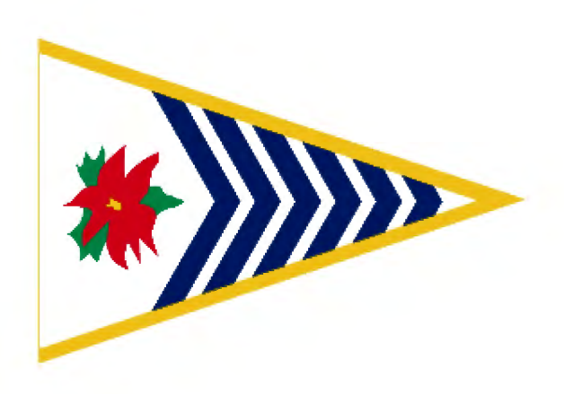
4" Burgee Decal 1.00