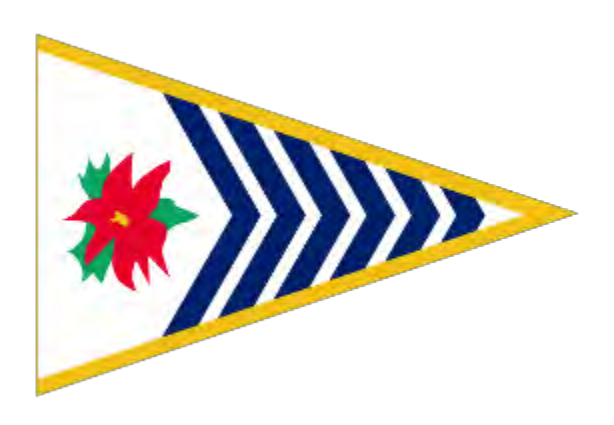
4" Burgee Decal 1.00