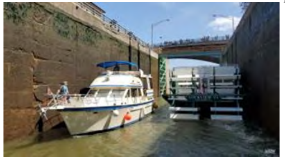
Learn locking through skills for new adventures on inland waterways.

Boating on Rivers. Locks, and Lakes prepares you to pilot confidently in fickle rivers, develop the special skills you need to deal with currents and shallows, know how to maneuver through locks, and learn the correct ways to maneuver in the presence of commercial vessels when you are boating on major inland waterways.