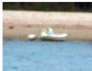
On the morning of the 7th we discovered the dinghy had gone ashore a mile or so

After a short swim, David recovered the boat and we were headed a little closer to Shelter Island and Greenport where we anchored in a spot called Pipes Cove. Then we began the great search for LPG. Peregrine has two 10 pound tanks but somehow 10 pound tanks are foreign to Long Island LPG suppliers at the Northern (Eastern) end of Long Island. We were unsuccessful in Greenport, Sag Harbor and Montauk. Greenport was good for sunsets, scenery, pizza, a ships chandlery and a pleasant walk around town while Pipes Cove was a very good anchorage with good views of the local fireworks (weather delayed perhaps).